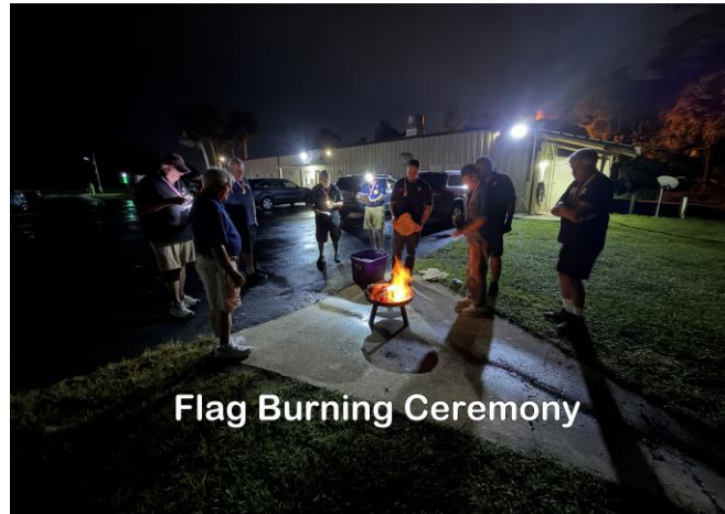
Flag Burning Ceremony